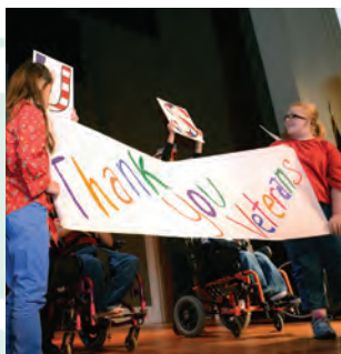
Students said thank you to veterans with a banner and "Go USA" signs.